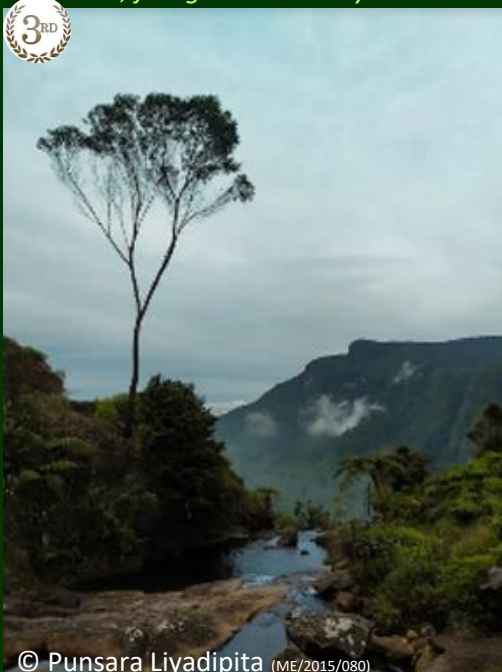
© Punsara Liyadipita (ME/2015/080) "Still believe in heavens above"