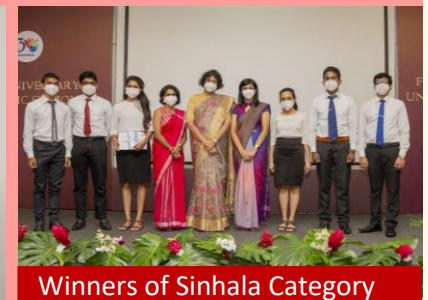
Winners of Sinhala Category