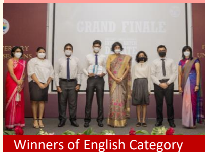
Winners of English Category