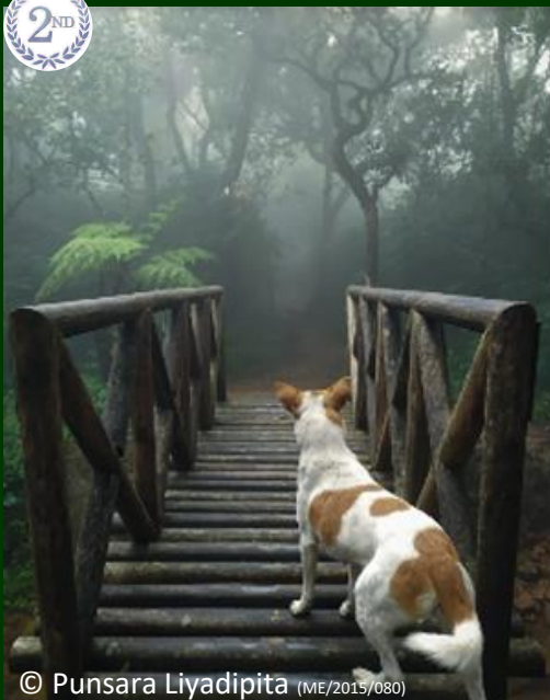
© Punsara Liyadipita (ME/2015/080) "No complaints raised, No questions asked; just guided the way"