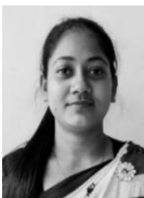
T.P. Egodapitiya Works Aide (Grade III)