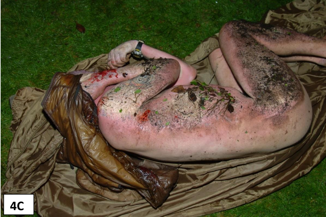
Photographs By courtesy of Dr. R. Harruff

4.1 What is the most likely circumstance? State the reasons